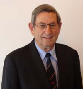
Sir William Birch (Chairman)

Sir William began his career in 1957, when he established a private practice as a surveyor in Pukekohe. His keen interest in community affairs led to six years as Deputy Mayor of Pukekohe and election to Parliament in 1972. During his 27 years in Parliament he served for 15 years as a Minister of the Crown. His portfolios included Energy, Labour, State Services, Health, Employment and six years as Minister of Finance between 1993 and 1999.